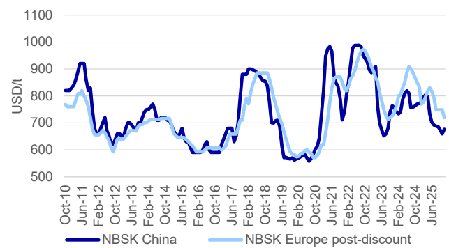
NBSK EUROPE POST ESTIMATED DISCOUNTS, USD/t